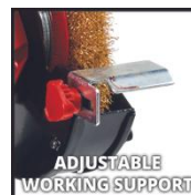
ADJUSTABLE WORKING SUPPORT