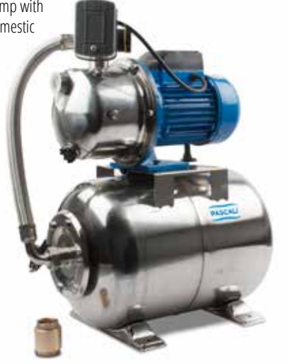
Non return valve included.